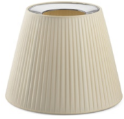
F6278007 Ktribe Floor/Table 2 fabric diffuser assembly