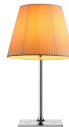
Table luminaire providing diffused lighting. Base, rod support and diffuser support in diecast, polished and chrome-plated Zamak alloy. Base cover in black injection-molded PA (Nylon). Injection-molded PC (polycarbonate) opal inner diffuser. Outer diffusers in transparent or fumée PMMA (polymethylmethacrylate), and silver or bronze on the inner surface, by vacuum aluminum coating. Injection-molded PC (polycarbonate) upper ring, completely transparent or transparent diffuser and silver diffuser) or transparent brown for the outer bronze diffuser.

Are you a professional and your project needs consulting and support?